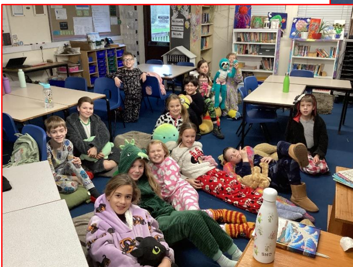
Year 5 & Year 6