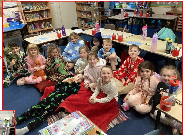
Year 3 & Year 4